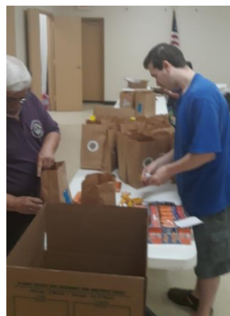
Lions and friends make quick work of assembling the 500 bags